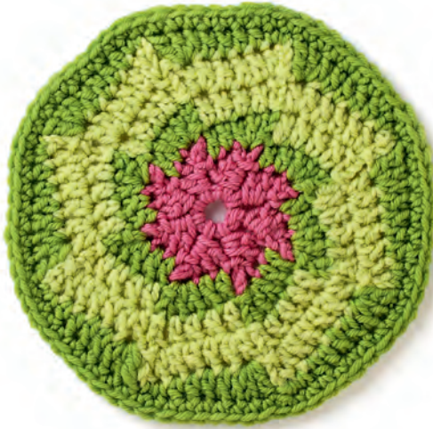
CIRCLE: 5¾" (14.5 CM)

An eight-pointed motif becomes a circle on the last two rounds. Try leaving off those rounds for a pinwheel, or if you want the pinwheel to be prominent without losing the circular shape, work the last two rounds in a color that will fade into the background.